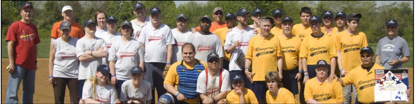
Loudoun County proudly showcased its two softball teams at the 1 st Annual Lance Gearing Grand Slam.